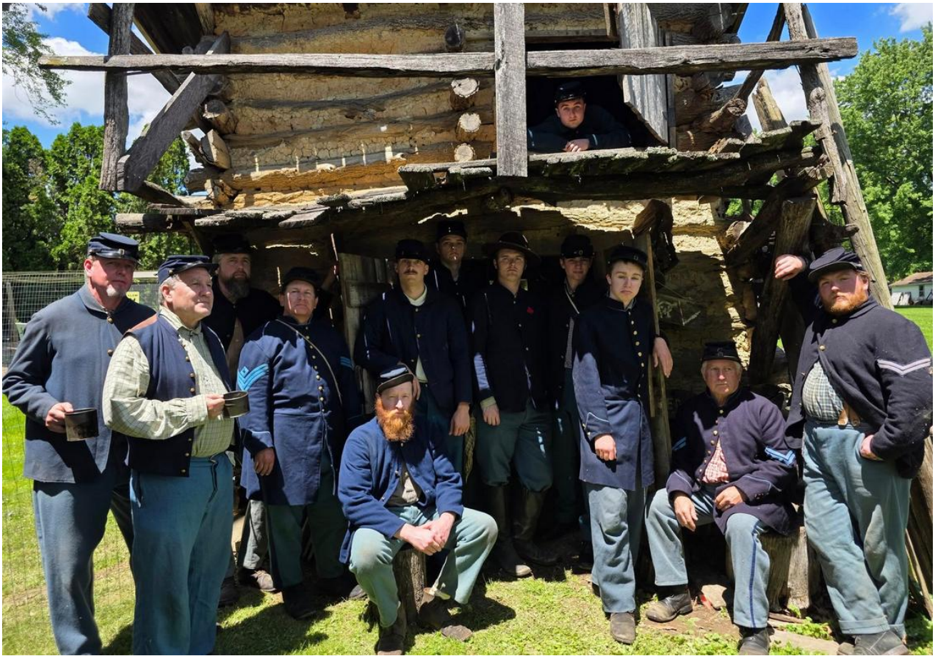
We even made it into the Hummelstown Sun