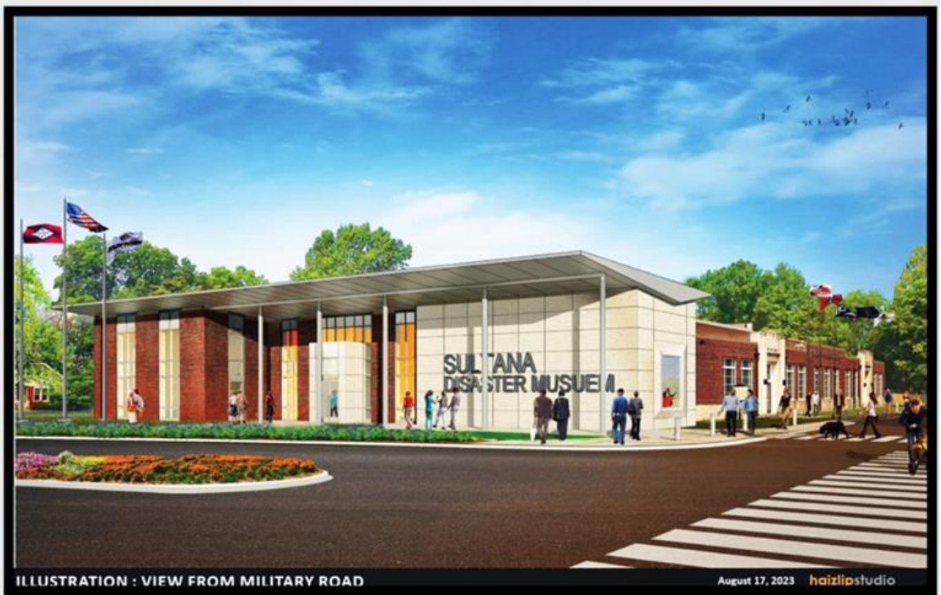
Rendition of the new Sultana Disaster Museum