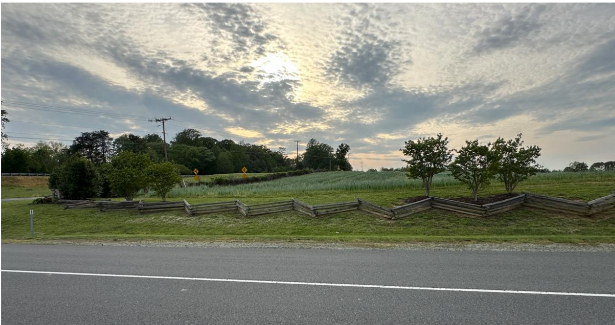
The intersection of Plank Road and Montpelier Drive near Chancellorsville looking west. The 53 rd PVI was positioned at this intersection on 1 May 1863 during the Battle Of Chancellorsville. The 145 th PVI fought nearby (to the right rear of this spot).

Some other photos showing some of the action from Wilderness 160: