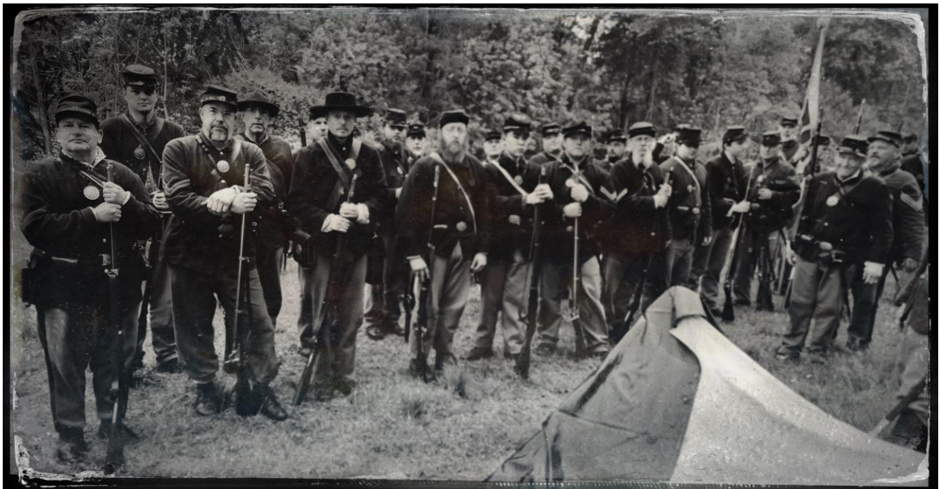
Company D – ELF (53 rd PVI, 1 st MD, 3 rd MD, and 7 th PA Res) (photo courtesy of Ira Siedel. Converted to tintype using an app by your editor)

Not the easiest to see, but the original trenches were visible (partially buried under leaves) at the site the event.