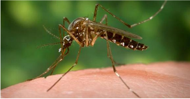
Yellow Fever Mosquito – CDC

seize on the garrison” if yellow fever appeared. Bragg’s response to this unorthodox strategy is unknown, but we do know it did not work.