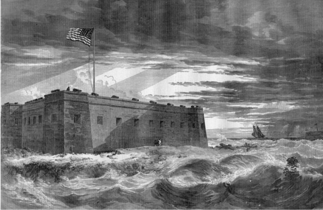
Ft. Pickens 1861 Harpers Weekly

By Chris McIlwain, January 10, 2022 (originally published May 1, 2020 in the Blue And Grey Dispatch) blueandgrayeducation.org