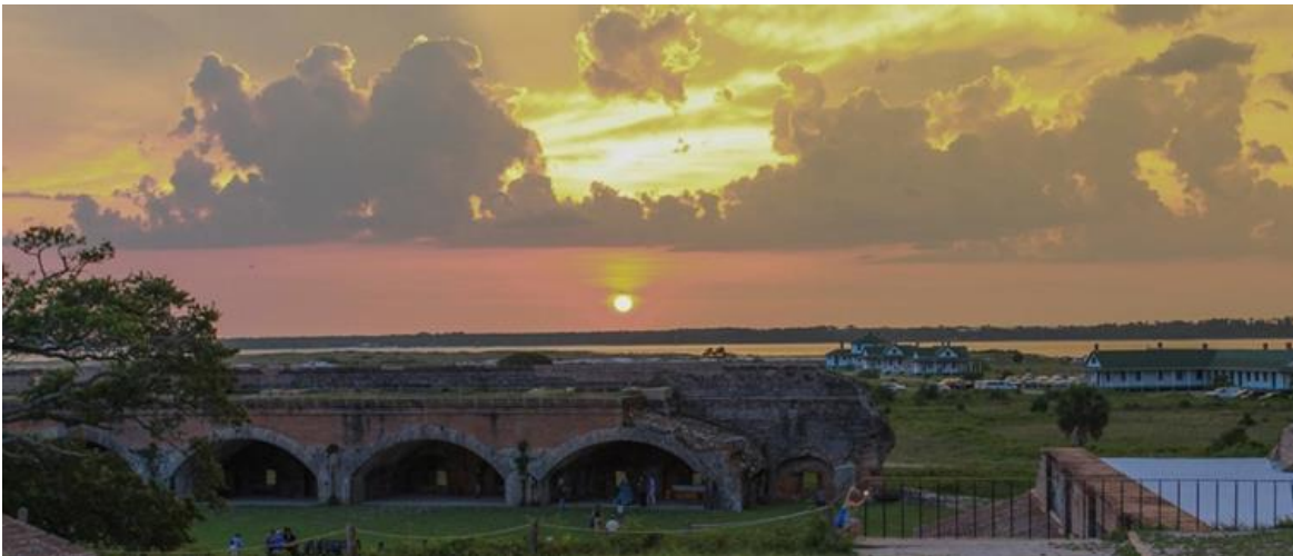
Ft. Pickens today

There was no significant yellow fever epidemic that summer, and Bragg eventually was transferred with a large portion of his men to Corinth, Mississippi, in preparation for the expected invasion of Union troops under Gen. U.S. Grant from Tennessee. Ultimately, the Confederates abandoned Pensacola in 1862, and it was eventually used as a major staging area by Union forces for the final invasion of Alabama in 1865.