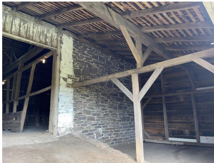
The Warfield House: