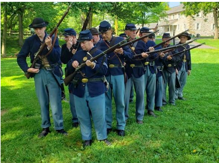
The company in the process of loading their muskets.