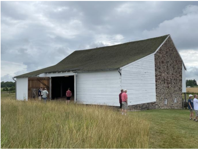
McPherson Barn -