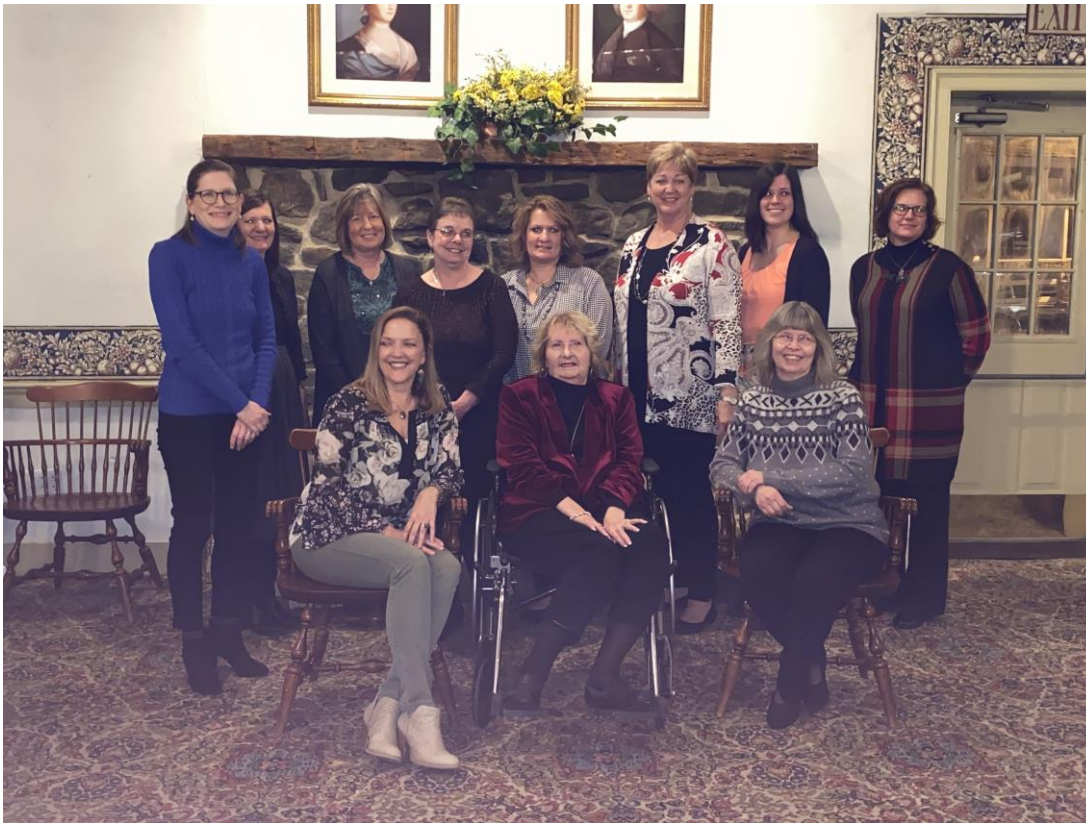
A group photo of the wives and better halves.

The election results were announced at the party and included: