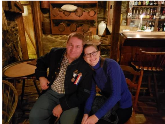
Me and my wife