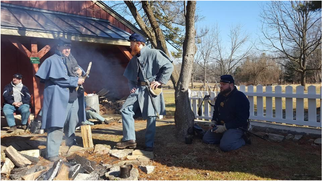
The men of the 53 rd taking a break from drill.