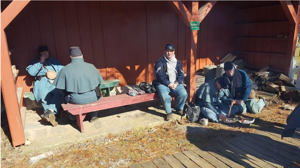
Taking a break from drill.