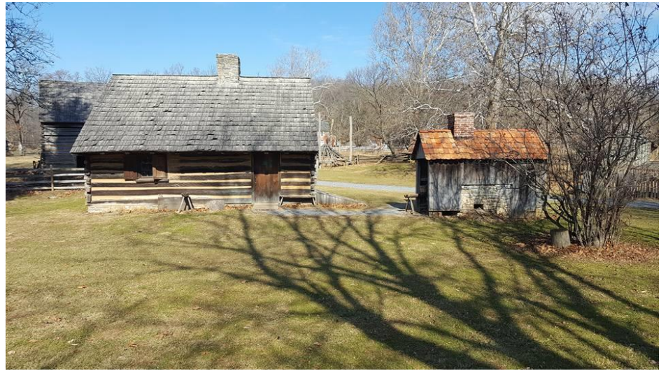
Our sleeping quarters Saturday night.