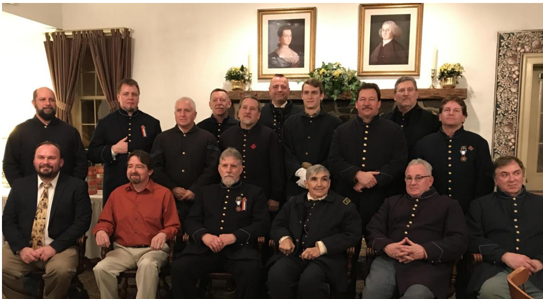
The men of the 53 rd PVI as well as our guest speaker

Holiday Party Photos