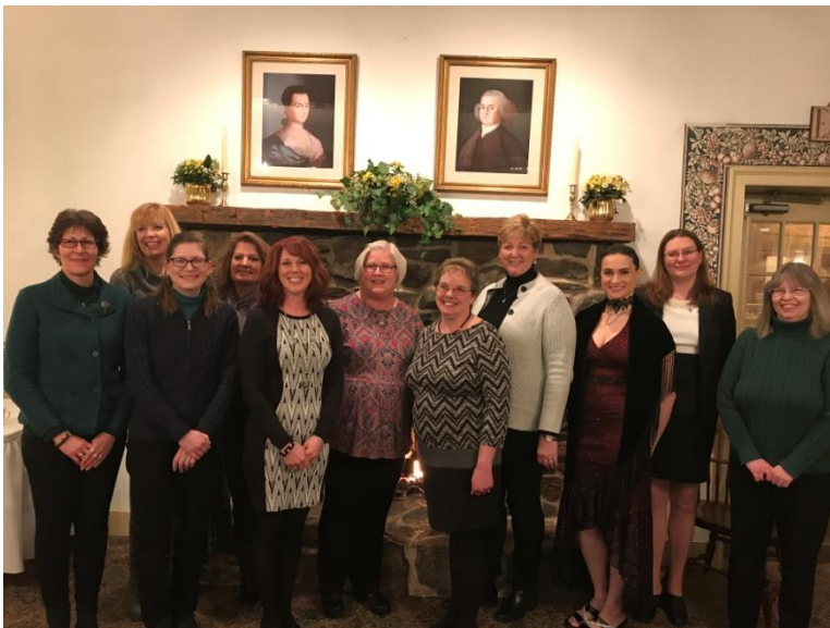
Spouses and significant others of the 53 rd PVI members attending.