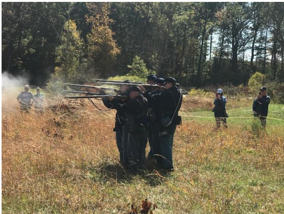
The men firing a volley for the crowd.