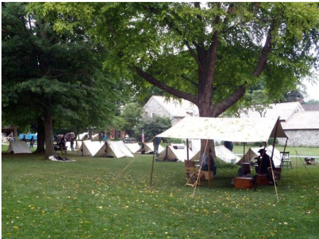
Camp at Landis Valley

Some other photos courtesy of Chip Smith (7 th PA Reserves):