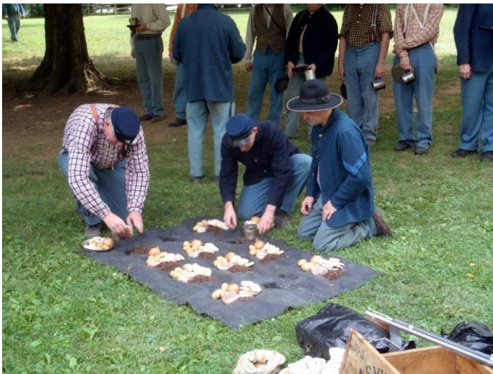
Rations issue... pork, beans, coffee, onions, potatoes, hard tack, and some bugs.